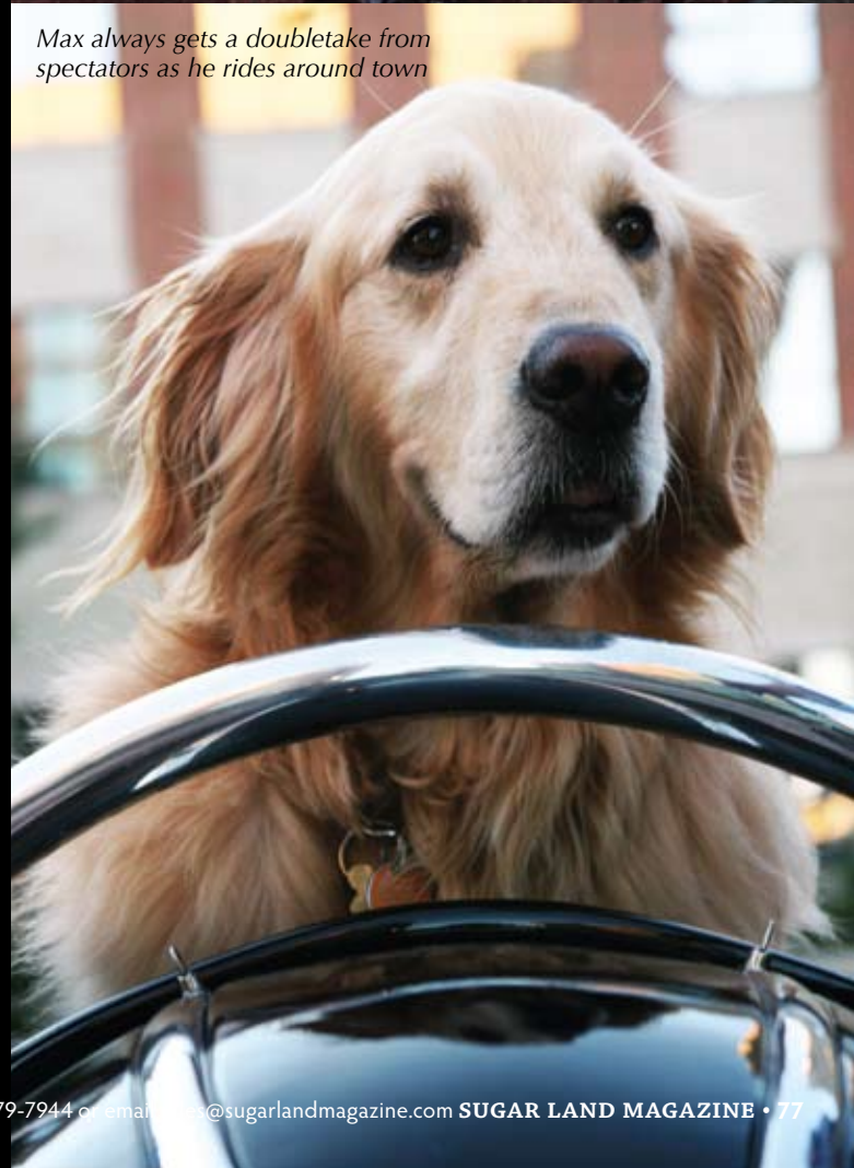
Max always gets a doubletake from spectators as he rides around town